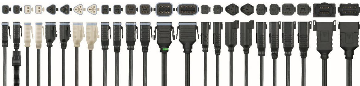
ESCHA PI0125: ESCHA ET-Family