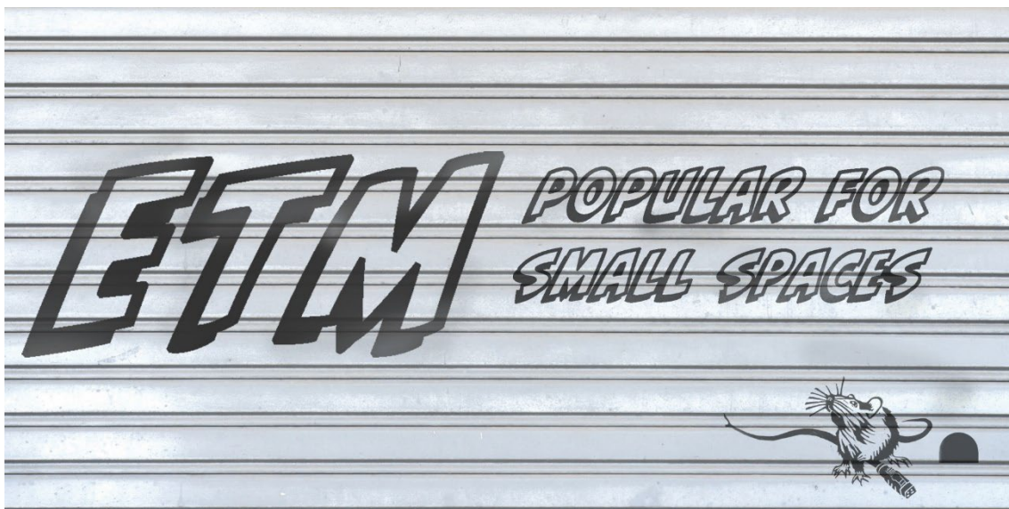
ESCHA PI0125: ETM: Maximum performance in the smallest space